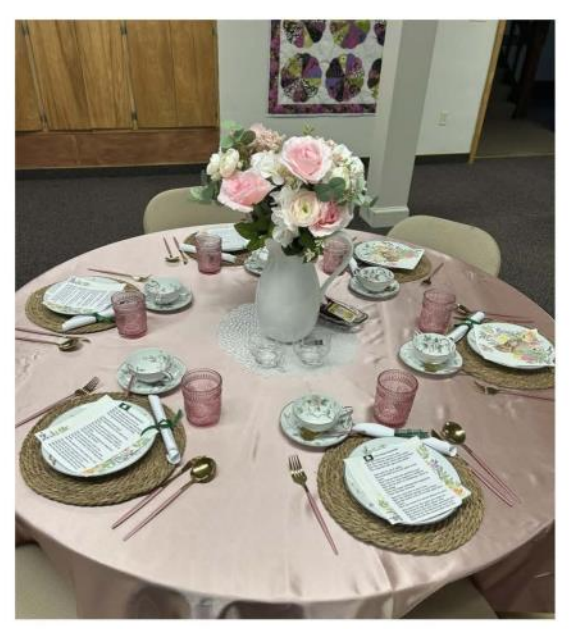
MaryBeth Ostrom's Table