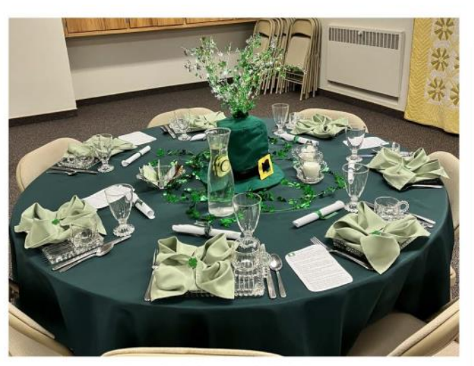
Laurie Magnus's Table