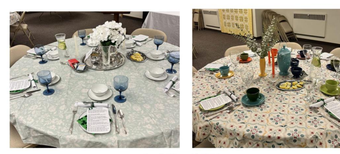
Sandy Strozyk's Tables