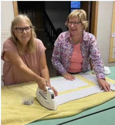
Smooth moves, no wrinkles