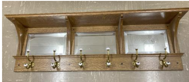
Prize 2: Handmade oak shelf with beveled mirror and coat hooks valued at $700. Donated by Gerri Ehler