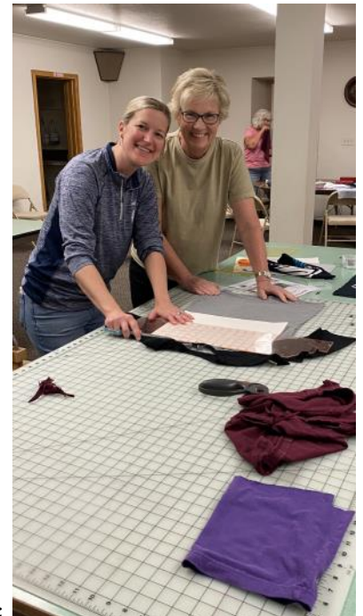
Measure twice, cut once!