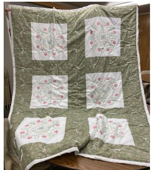
Prize 3: Handmade Twin sized Quilt valued at $200 Donated by the Greenfield Quilter's Group