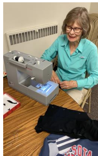
Sew much fun!